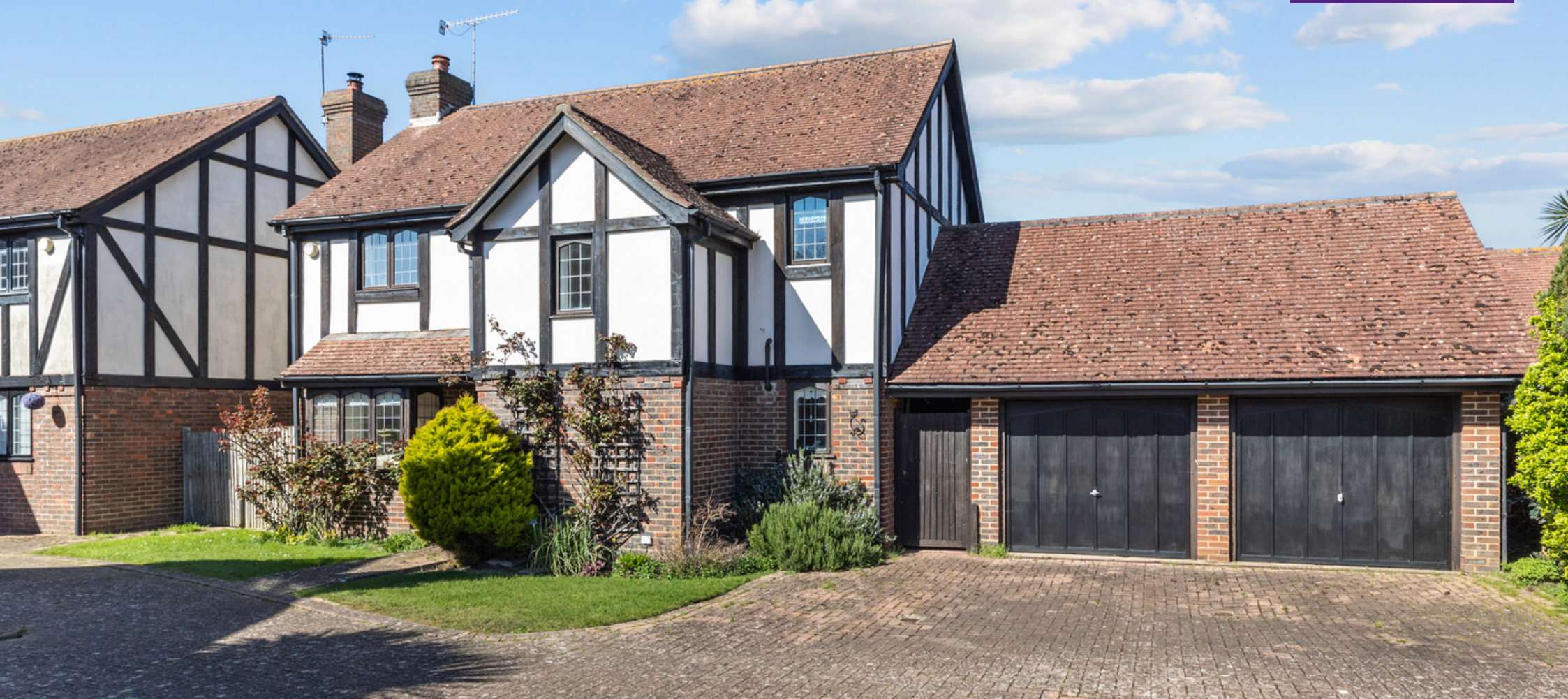
2 Spinnals Grove, Southwick, West Sussex, BN42 4DU